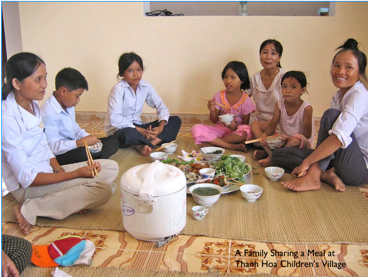
A Family Sharing a Meal at Thanh Hoa Children's Village